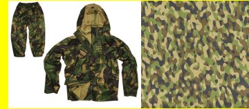
Camouflage Clothing & Material