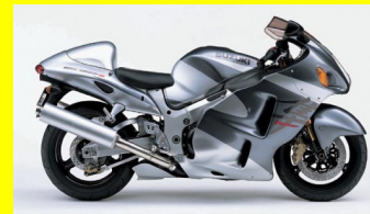
Motorcycles over 700cc