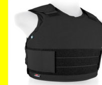
Bullet Proof Vests