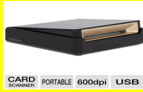
Credit Card Scanner