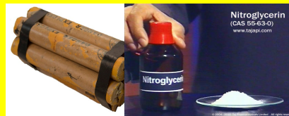
Dynamite & Nitro-glycerine