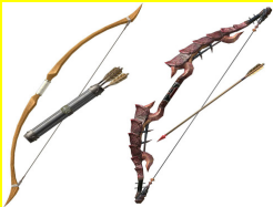
Bows & Arrows