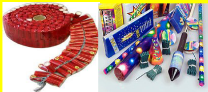
Fire crackers & Flares