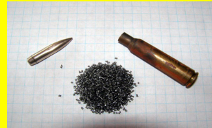
Gun Powder and Cartridge