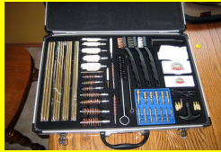
Gun Cleaning Kits

NCB North Tower 2 Oxford Rd., Kingston 5 Website: www.mns.gov.jm Email: protective.security@mns.gov.jm Telephone: 1(876) 906-4908, 906-4080